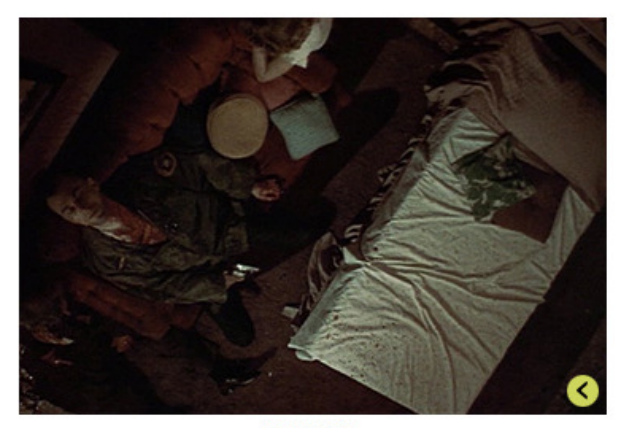
THE SHOT Top Shot

A shot where the camera is tilted on its side to create a kooky angle. Often used to suggest disorientation. Beloved by German Expressionism, Tim Burton, Sam Raimi and the designers of the villains hideouts in '60s TV Batman.