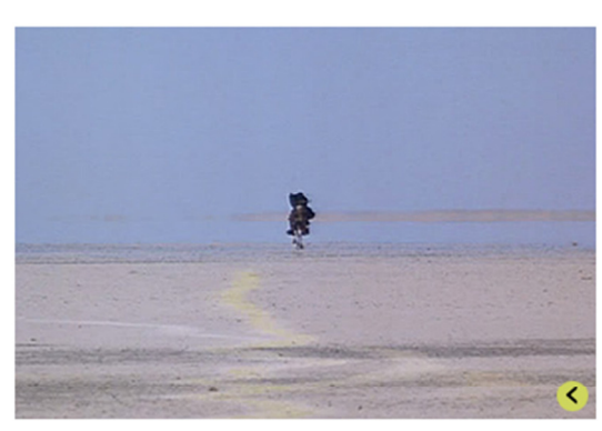
THE SHOT Long Shot

The shot that utilizes the most common framing in movies, shows less than a long shot, more than a close-up.