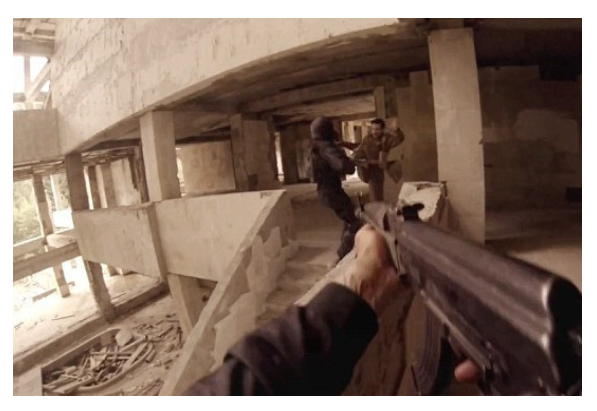
THE SHOT POV shot

A shot that depicts the point of view of a character so that we see exactly what they see. Often used in Horror cinema to see the world through a killer's eyes.