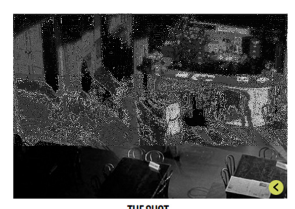
THE SHOT High Angle Shot

A shot looking up at a character or subject often making them look bigger in the frame. It can make everyone look heroic and/or dominant. Also good for making cities look empty.