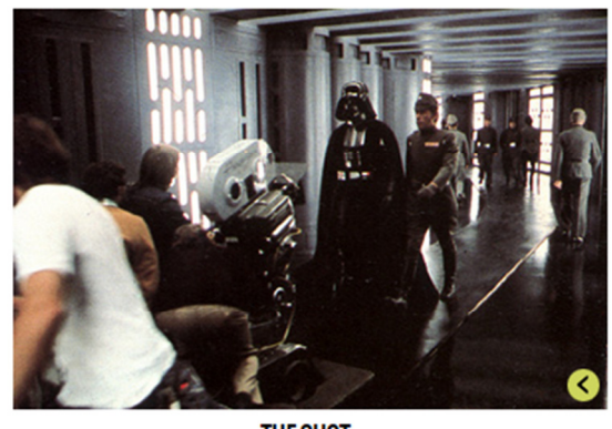
THE SHOT Low Angle Shot

A shot that depicts an entire character or object from head to foot. Not as long as an establishing shot. Aka a wide shot.