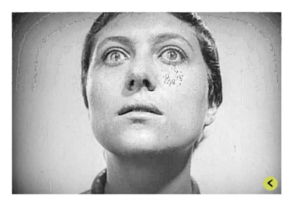
THESHOT Close Up

A shot that keeps only the face full in the frame. Perhaps the most important building block in cinematic storytelling.