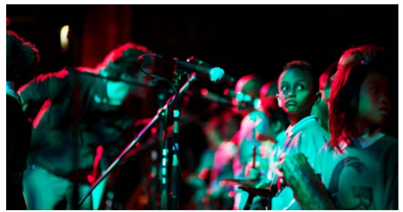
Philosophy for Children Network Meeting (Primary and Secondary)

The aim of these network meetings is to provide opportunities for participants to explore key issues relating to Philosophy for Children (P4C) in the primary and the secondary curriculum. Topics covered include: